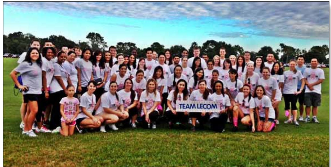
Making Strides in 2013. Beta Iota chapter.