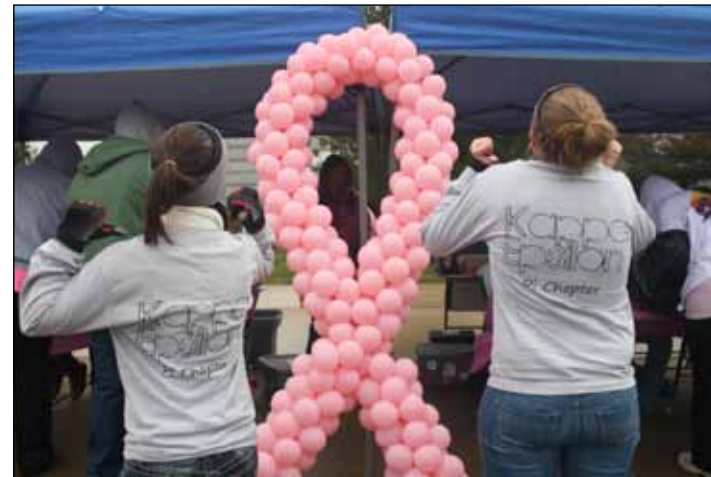
Pi Chapter shows their KE pride at Making Strides.

Great job promoting our national project, KE!