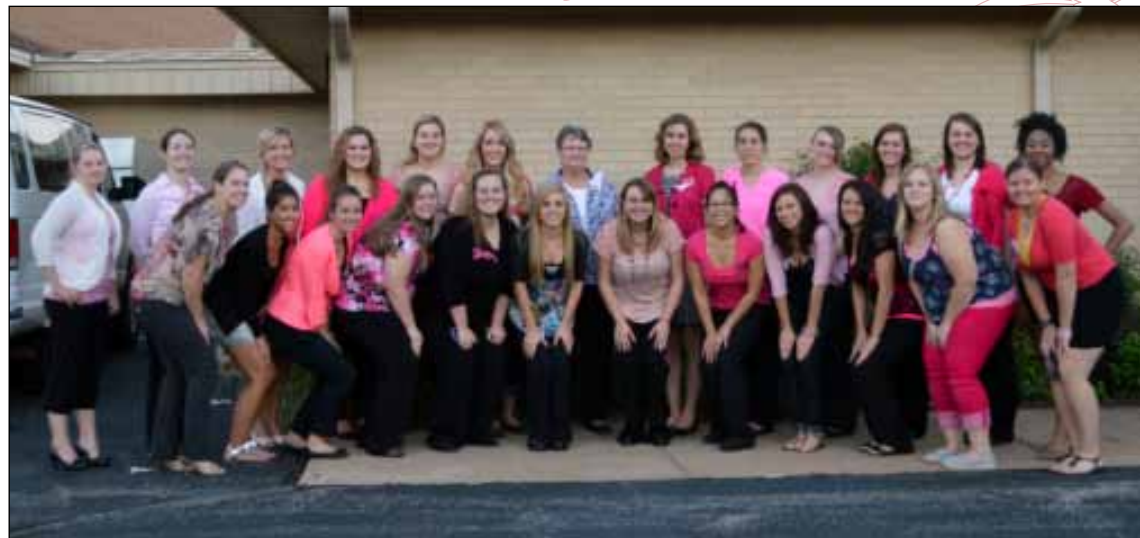
Beta Alpha members host their annual Breast Cancer Awareness breakfast with Breast Cancer survivors.