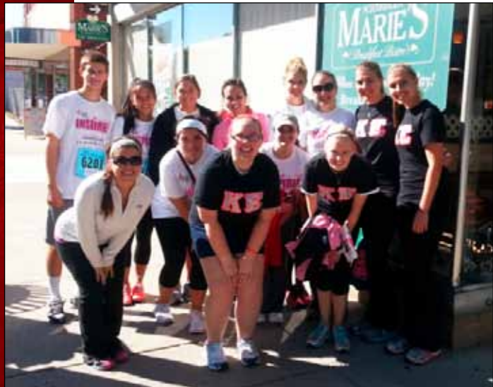
Psi and Beta Zeta Chapters team up for their local Susan G. Komen event.

their faculty to allow fellow students to dress down on lab days if they make a donation. A seminar with a PGY2 hematology/oncology resident was also held to educate pharmacy students on cancer from a pharmacist's point of view.