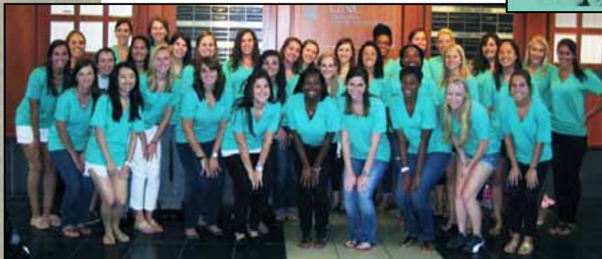
Sisters in their recruitment T-Shirts. (design above)