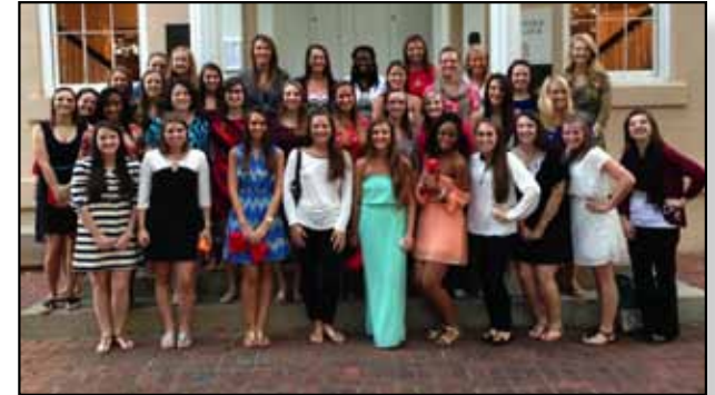
New Members and Their Big Sisters

and we are hoping that our donations will help to get her into clinical trials in the next few months.