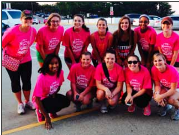
Part of Alpha Lambda Walk for Life Team

raise money and volunteering as well as hosting social events to allow members to bond with each other.