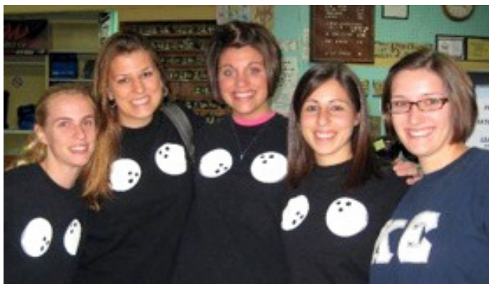
Alpha Chi chapter at Shenandoah University