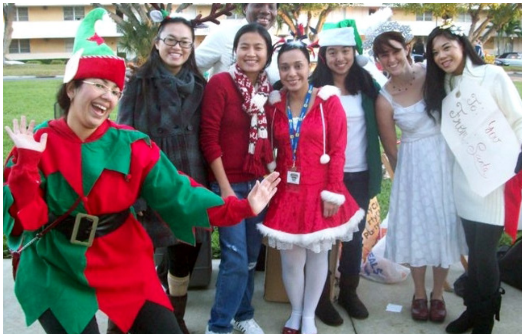
Alpha Psi chapter at Palm Beach University

Regardless of the early start, we had a great turnout of KE members and a few other brave souls to bear the cold