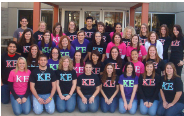
Beta Zeta chapter at University of Findlay