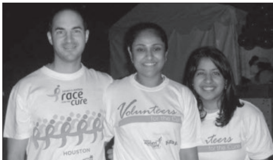
Upsilon participating in the Houston Susan G. Komen Race

Upsilon carried the torch for Breast Cancer Awareness by participating in the Susan G. Komen Houston Race for the Cure. No threat of rain was going to keep us away from this event! At the end of the month, the KE Halloween Party drew a big crowd with appearances made by a pharaoh and werewolf! In November, KE had a strong presence at the University of Houston College of Pharmacy's Clinical Skills and Patient Counseling Competitions with several members making it to the finals! Members also participated in Heartburn Awareness events at local retail pharmacies, a new com-