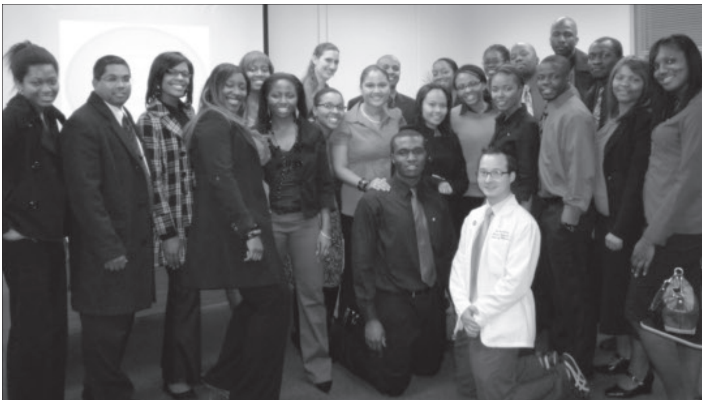
Alpha Pi Chapter Members