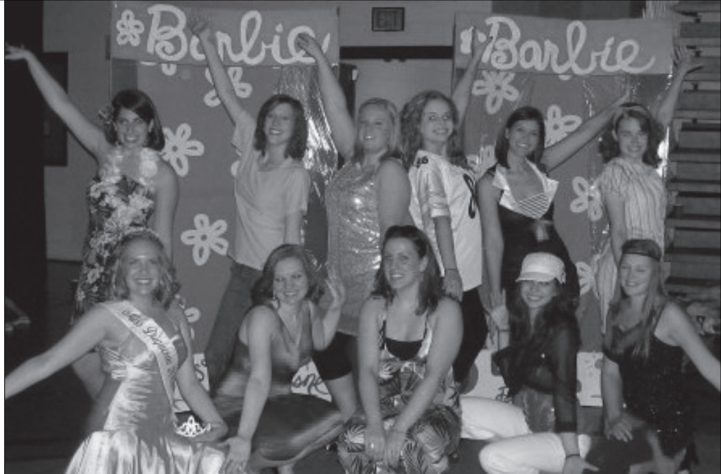
Alpha Phi Members