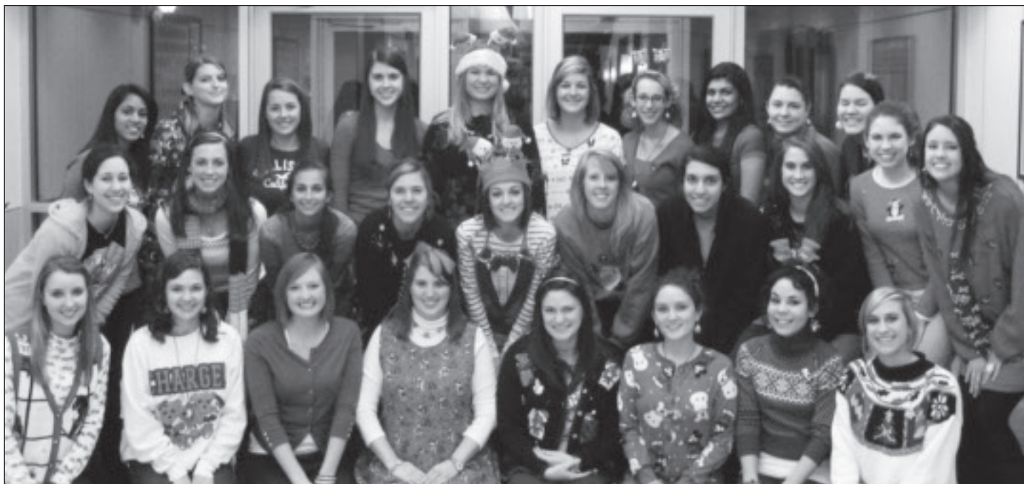
Alpha Epsilon Chapter

Our chapter has worked diligently over the last semester to improve established projects and initiate new ones. We have been busy! We kicked off the year with our 2nd annual College of Pharmacy Family Day. We served desserts and punch and offered tours of the College for all students and their families. What a way to start off the year! We held recruitment in September with a challenging Photo Hunt followed by Riverside Barbeque. We recruited 16 potential new members, who began their six week education period and created the KE bond with them. Initiation