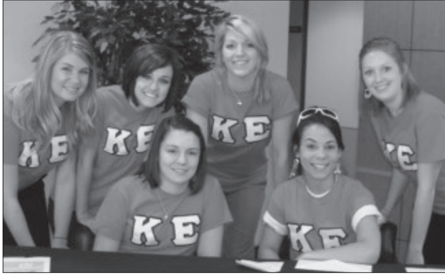
Alpha Epsilon Members at their T-Shirt Sales table

Secondly, ask "What does my campus need, what do they like, and what haven't they seen before?". If your fellow students and staff get