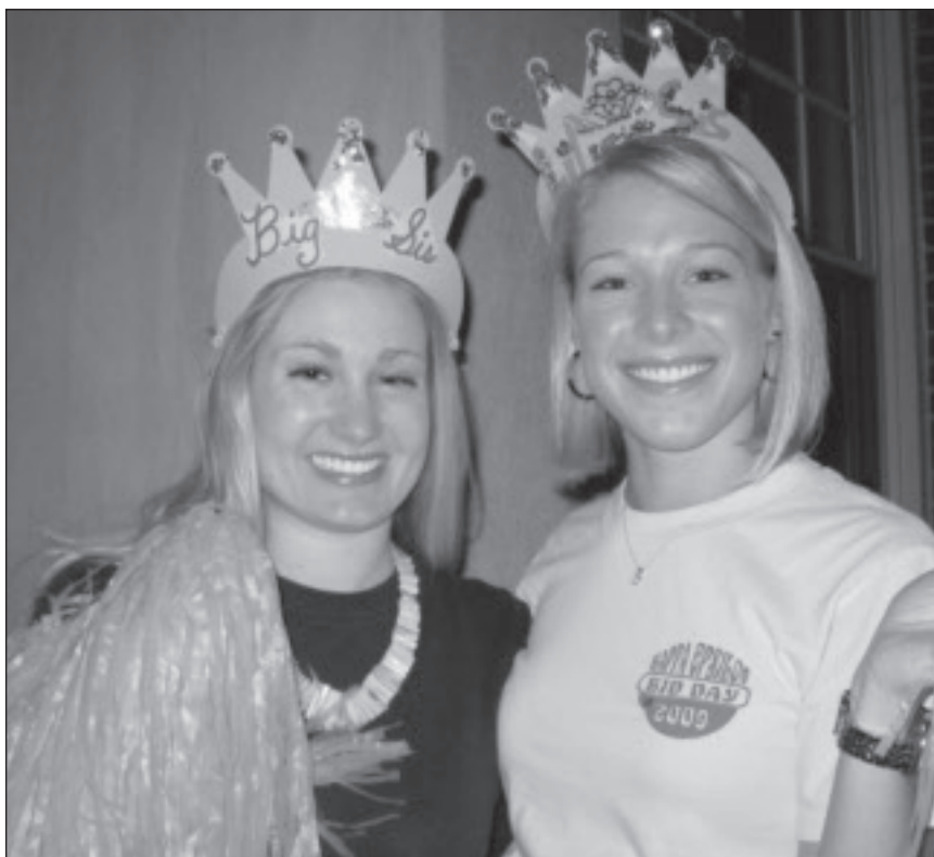
LAMBDA Big & Little Day