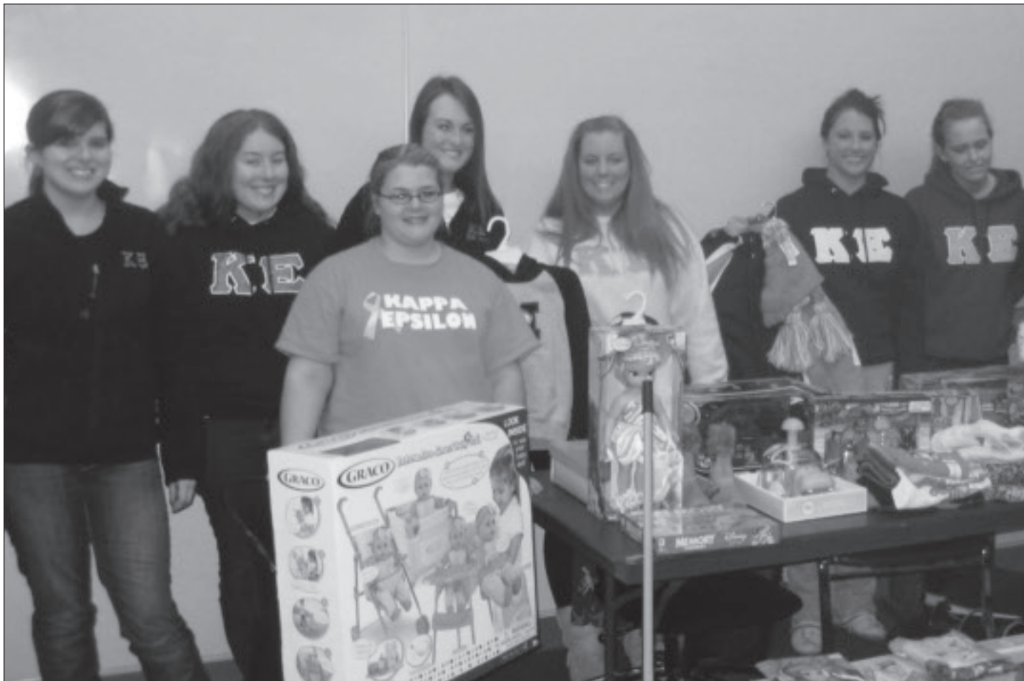
Alpha Omicron members working with Crisis Nursery Holiday Hearts.