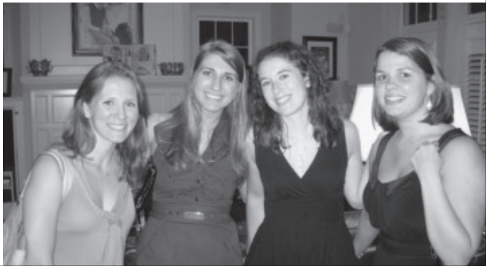
Some of the Lambda Ladies