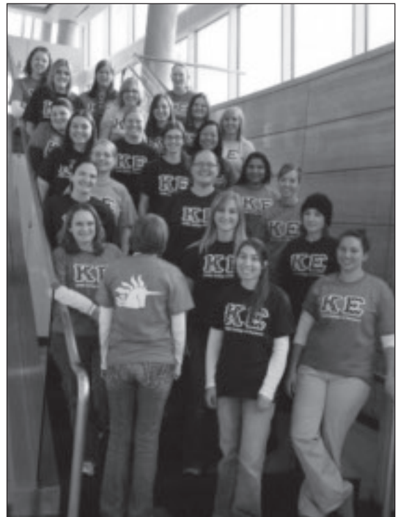
Top: Beta members at the Race for the Cure.

This fall, we initiated 22 new members to our small chapter. We tripled in size over one recruiting period! I feel strongly that the tools we learned at convention are a major part of that success. We leave Indianapolis with a multitude of wonderful ideas and new friendships, but we were also given a new energy and attitude towards how Kappa Epsilon is for life. Convention not only helped us to see the bigger picture of KE and gave us the tools to share that with our current and potential new members here at home, but it also instilled in us that we can always