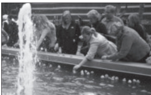
The members of the Alpha Phi chapter around campus