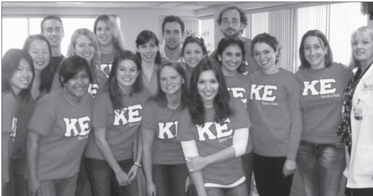
Beta Alpha at their Breast Cancer Awareness Seminar