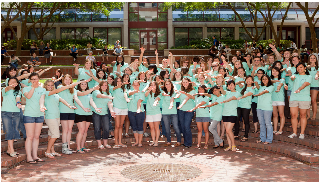
Kappa Chapter taking their signature "chomp" out of breast cancer