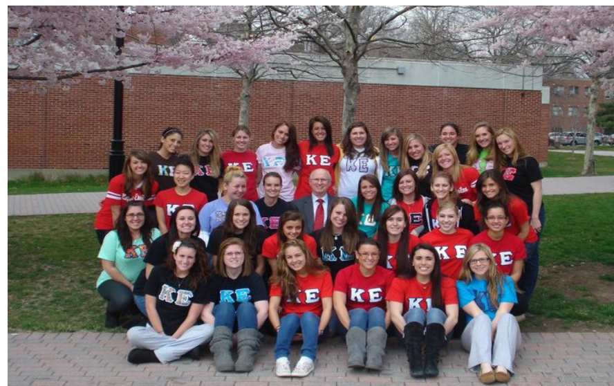
Omicron Chapter showing off their colors

Omicron also hosts events in the spring to raise money for the Susan G. Komen foundation. Every spring the university hosts Student Appreciation Day where KE holds its “Sweethearts” event. The Omicron chapter gathers