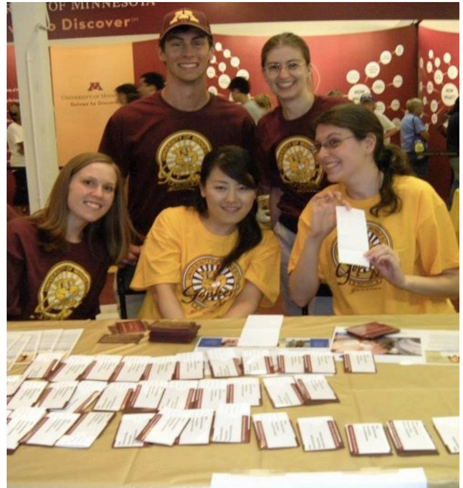
Alpha chapter members