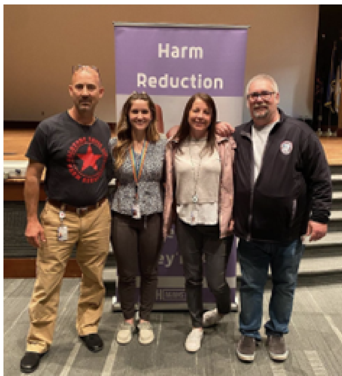
Hancock County Public Health Department members who spent their evening teaching University of Findlay Students about Naloxone.