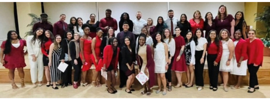
2022 Prospective Member Induction Ceremony