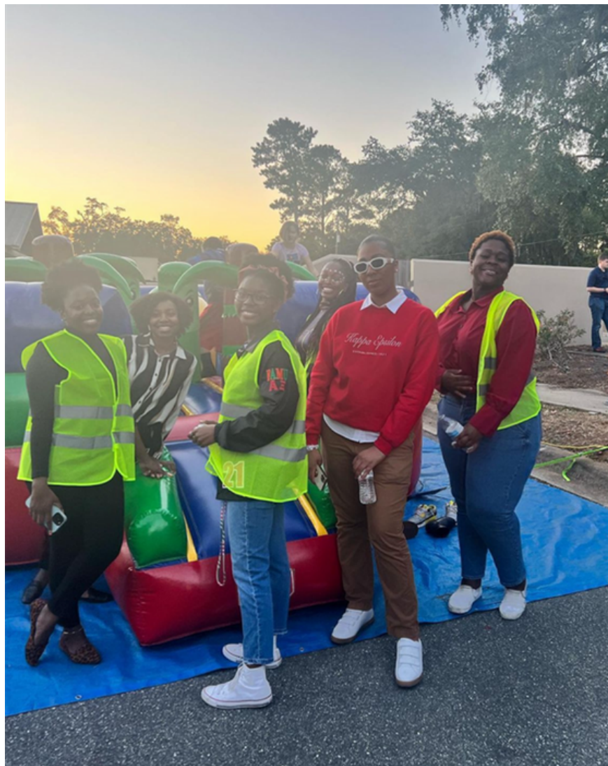
Members at the local Trunk 'r Treat.