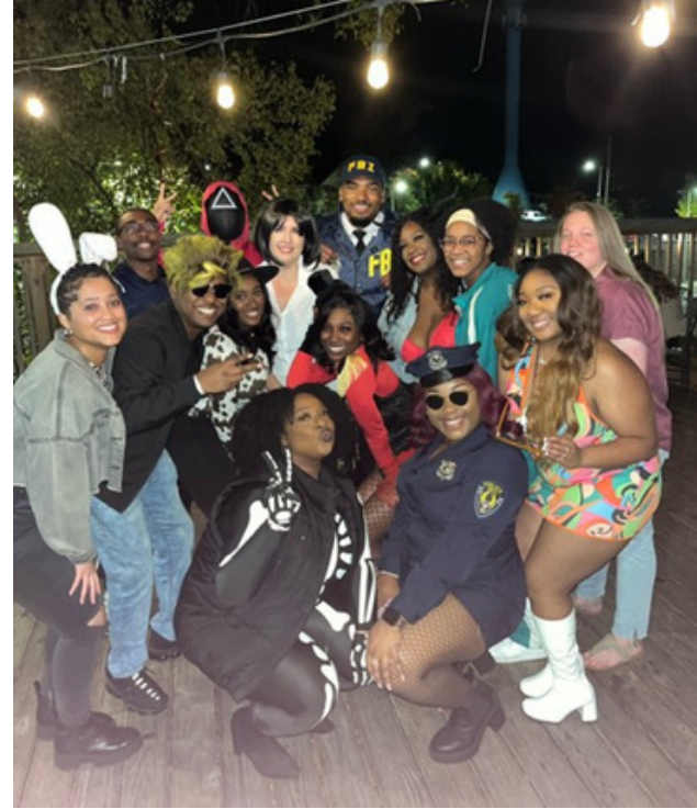
Halloween Party 2022

“Overall, our chapter has grown with membership, the activities we now hold, and the service projects that are performed each semester. We cannot wait to see what the future holds as we develop into pharmacists, leaders, and philanthropists.”- Alpha Gamma Chapter