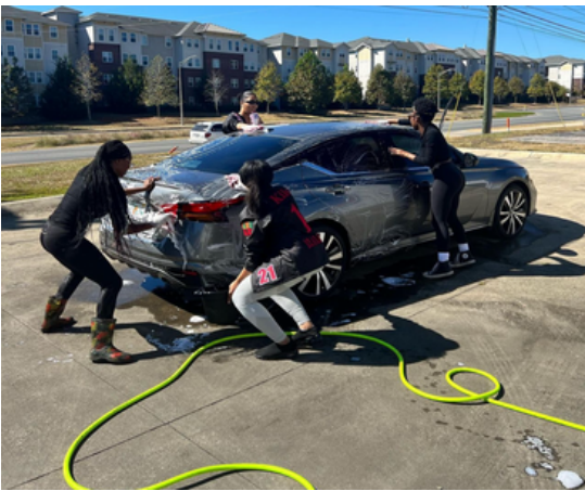
Chapter members hosted a car wash.

The members of Alpha Xi Chapter participated in various activities including community service events, fundraisers, and bonding activities for Fall 2022. Now that the chapter is in-person, precautions are still a priority with activities such as social distancing and providing hand sanitizer. Members were able to participate in a greater variety of service events this year, including a Trunk 'r Treat at the local preschool assisting with set-up and overseeing games for the children. The Alpha Xi chapter shared "through a car wash, the chapter raised over $200 for KE." Chapter members hosted a bonding event with pharmacy peers to relieve stress before finals.