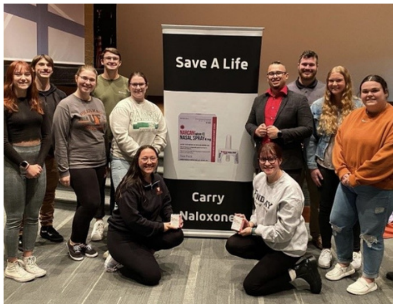
KE, AZO, PDC, and APhA-ASP students who ran the event pose for a photo.