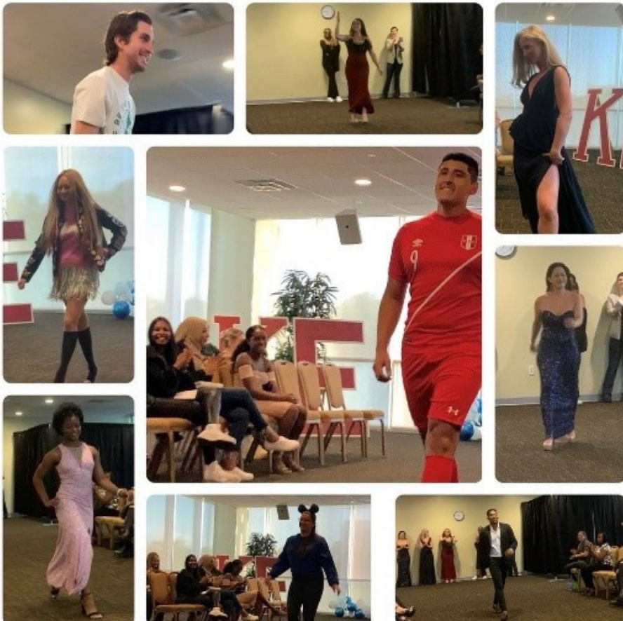
2022 OCA Kat Walk Fashion Show

Furthermore, the chapter has held many networking events that have helped members deepen relationships and experiences with other professional organizations. A few members were also able to participate in the Regional Retreat on April 9th in Tallahassee FL.