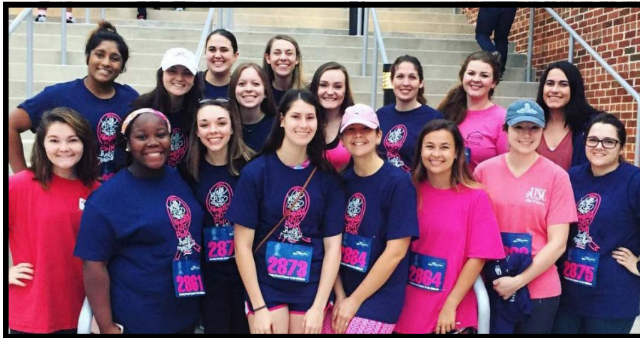
Sisters at the 'Walk for Life & Famously Hot Pink Half Marathon' hosted by Palmetto Health!

Finally, we are excited to welcome a new class of 25 members this Fall 2018 and are looking forward to our 'Bid Day' at the Riverbanks Zoo & Garden. We are so excited to see what this school year has to offer!