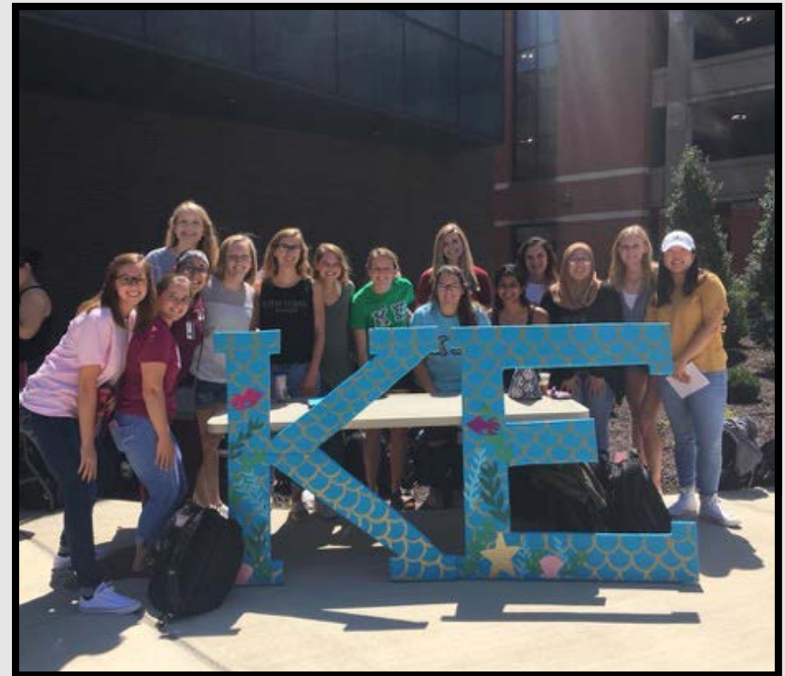
Active members meet with potential new members during Meet the Greeks