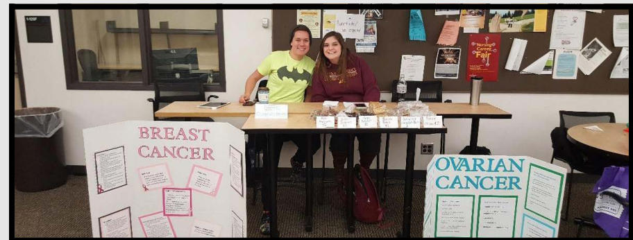
February 2018 – Bright Pink Bake Sale

Kappa Epsilon members volunteered time to assist in the packaging of dry-goods and food to help reduce hunger in our local communities.