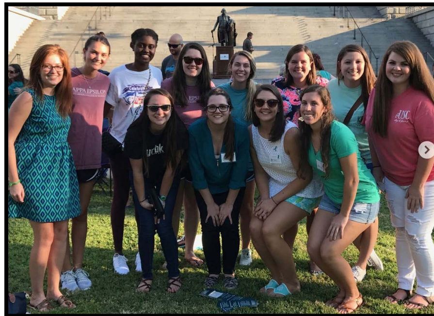
South Carolina Ovarian Cancer Coalition Butterfly Release

Our sisters joined survivors and families at the annual 'Butterfly Release' event hosted by the South Carolina Ovarian Cancer Coalition. We passed out informational pamphlets about the disease and at the end we joined in releasing the butterflies, honoring those who've been affected by Ovarian Cancer.