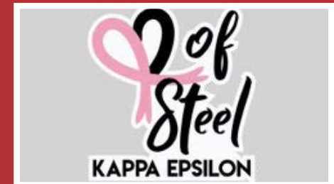
Our breast cancer t-shirt design for fall of 2018.