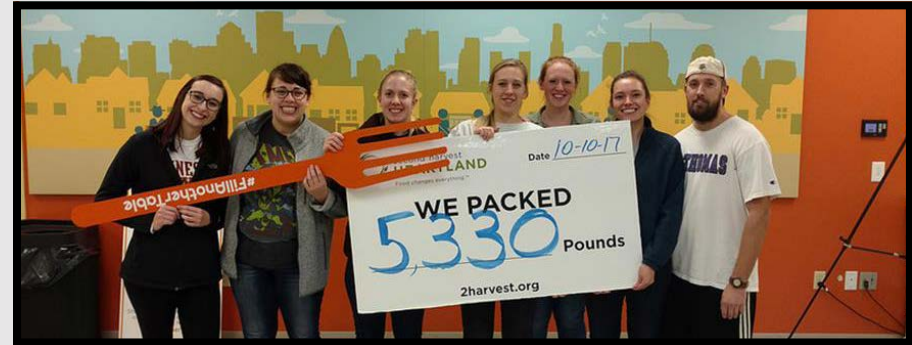
October 2017 – Second Harvest Heartland

Kappa Epsilon members volunteered time to assist in the packaging of dry-goods and food to help reduce hunger in our local communities.