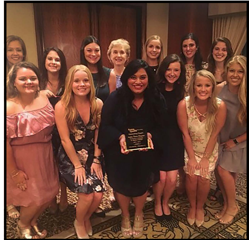
Our members who attended KE Convention in New Orleans with our Outstanding Chapter Award