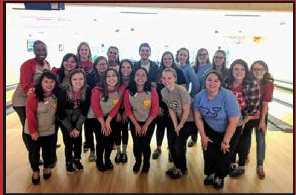
Delegates from Psi, Pi, Rho, Alpha Phi, Beta Zeta, Beta Pi enjoy a bowling break during regional retreat at Ohio Northern University!

Sunday morning. We met delegates from the Pi, Rho, Alpha Phi, Beta Zeta, and Beta Pi Chapters! The “business” side of the retreat consisted of different presentations from attending chapters on various aspects of KE – social, service, national projects, etc. Each presentation typically also had a discussion period afterwards. The “social” side of the retreat was a little more challenging for us to plan. If you’ve ever been to Ada, Ohio, or any small town in Ohio, for that matter, you may know that there’s not as much to do as larger towns. Thankfully, our six lane bowling alley was able to squeeze us in, and the group headed over for some jalapeños (Ada version of chipotle) and bowling! Overall, hosting the regional retreat was a success. We learned a lot, had a lot of fun, and most importantly, made bonds with members from other chapters!