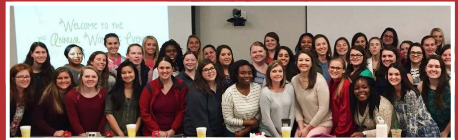
Alpha Lambda Chapter hosting our 2nd Annual Women in Pharmacy Day Event!