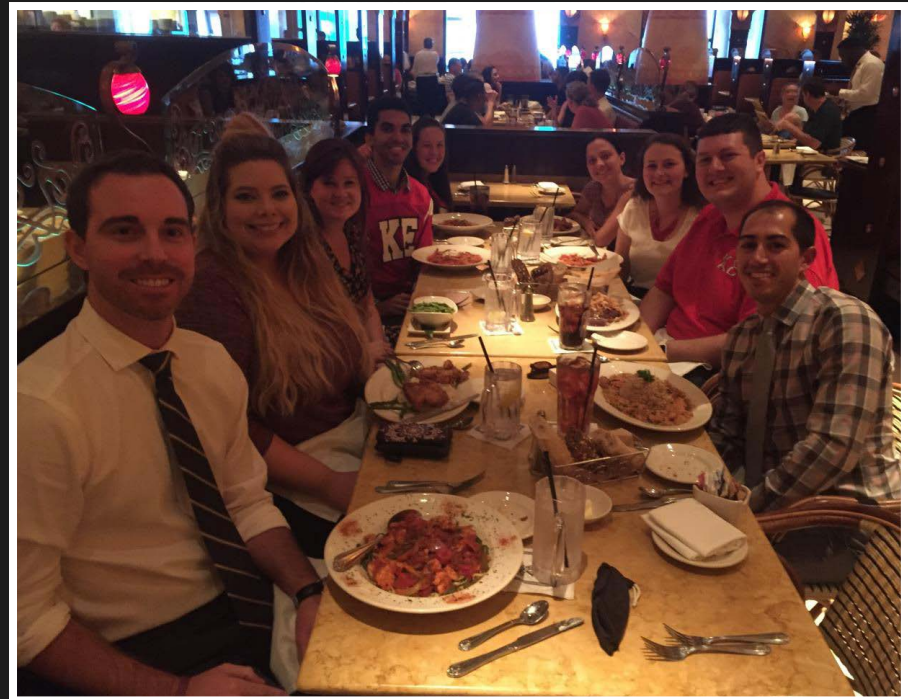
Alpha Psi members showing off our pink during our annual Pink It Out Day to promote breast cancer awareness.