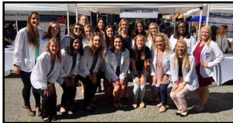
Sisters attending the Duquesne University Health Fair representing Kappa Epsilon and Women's Health, in downtown Pittsburgh.

Another event that we participate in with other pharmacy organizations is our annual Duquesne University Health and Wellness fair. All of the pharmacy organizations on campus set up tables downtown in the city and provide health information, screenings to the general public and even Zumba lessons. Our chapter hands out information concerning women’s health as well as pink and teal ribbons for breast