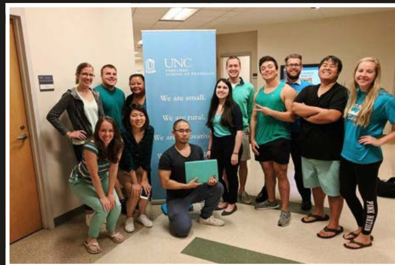
Wearing teal for Ovarian Cancer Awareness month!