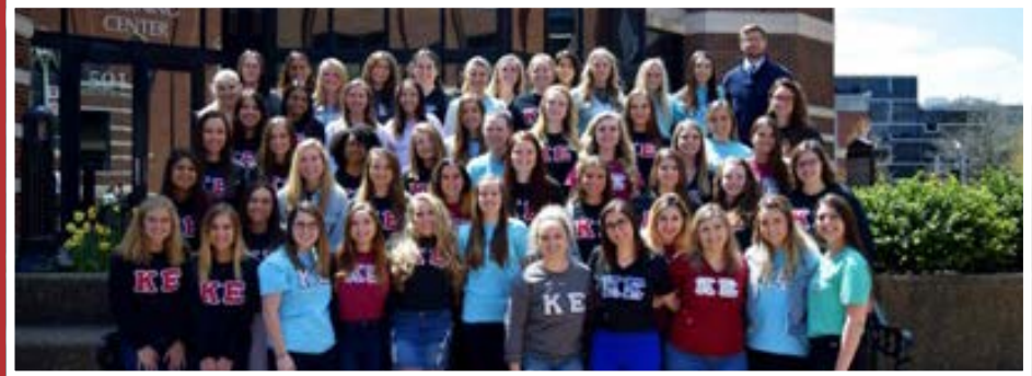
Annual spring picture in front of Bayer Learning Center, one of the pharmacy buildings on campus.

As you can see, the chapter of Alpha Phi treasures this time of year. We flourish as student pharmacists and together as sisters, we are empowered women who continue to support women's health, with the hopes of making a difference in the lives of others.