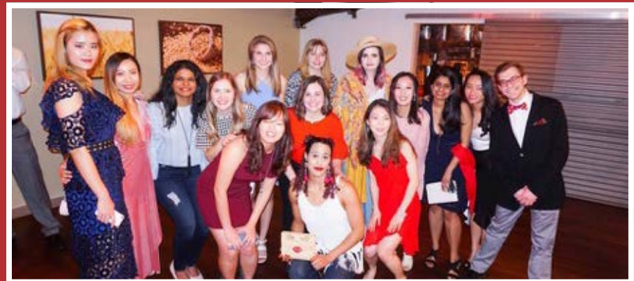
Our models in their fashion show attire!