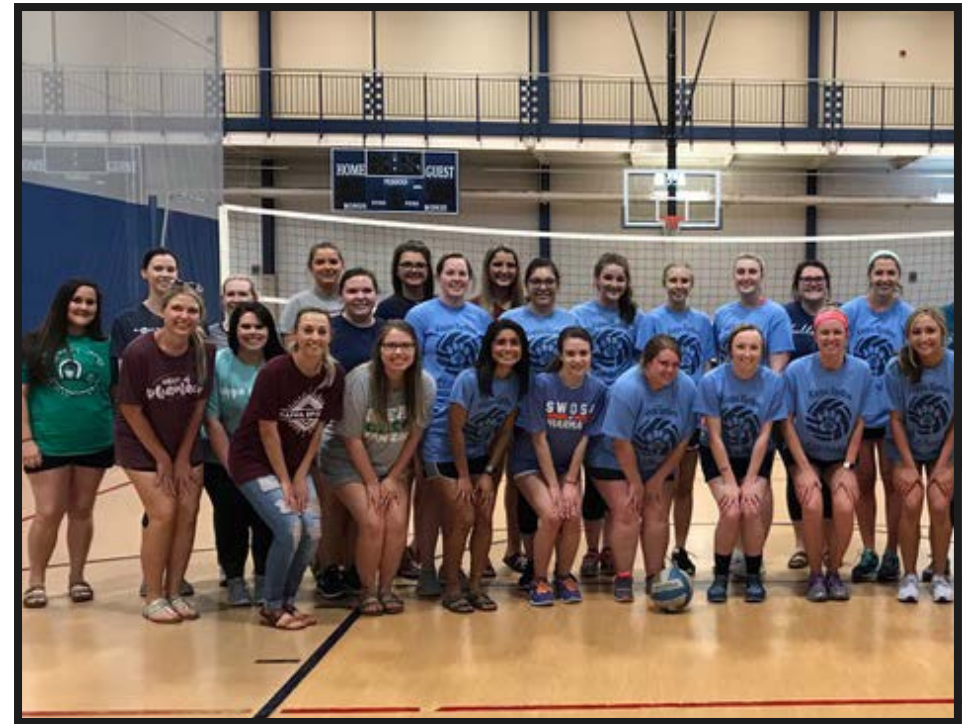
Members pose for a celebratory photo after winning the annual chapter vs. faculty volleyball game.