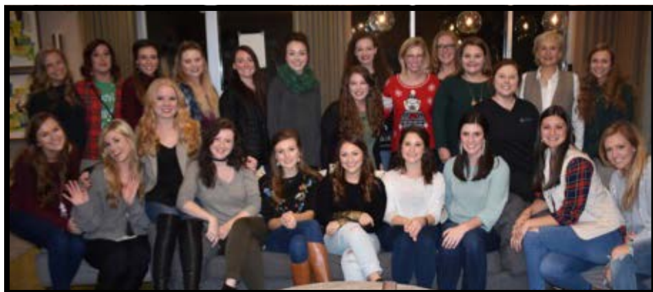
Ornament Exchange Christmas Party