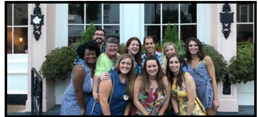
2017-2019 Grand Council Midterm Meeting, Charleston, SC