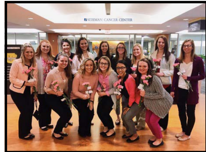
Deliver Carnations to cancer patients at Siteman Cancer Center