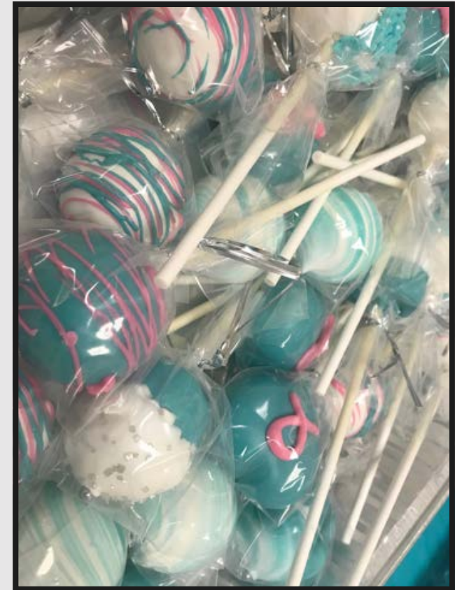
Breast and ovarian cancer awareness themed cake pops donated and sold at Psi Chapter's first ever teal bake sale.